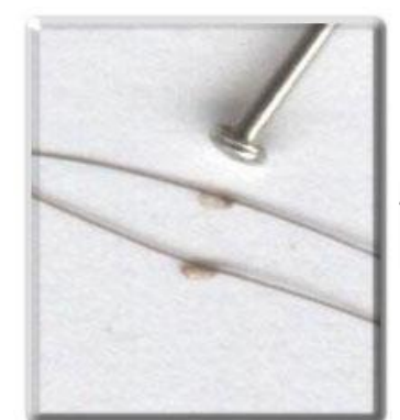
Attached nits enlarged